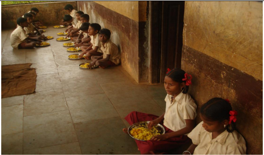
MDM: No discrimination observed