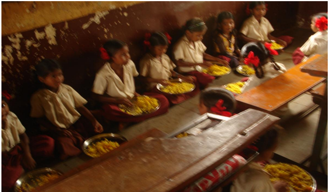
MDM: Students used to sit in classroom for eating

It was noticed that in 37 schools (92.5%) the students used to sit in school verandaha or in classroom or in open place in school premises and the cook and helper served the food. In 03 schools students used to stand in queue to get the food and then children used to sit in a row at school verandah. Then they use to recite a prayer and take the meals.